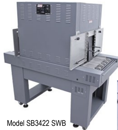
Model SB3422 SWB