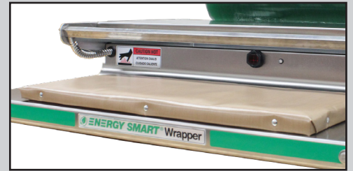
Flush Seal Plate