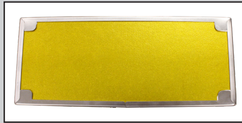
Mica Seal Plate